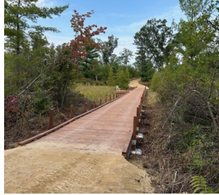
Photo: New Boardwalk for 2025.

Register online at: active.com or mail to: Navarino Nature Center W5646 Lindsten Rd. Shiocton, WI 54170